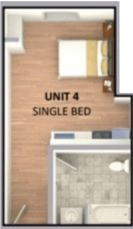
Studio room layout = full bath, kitchenette, and living space