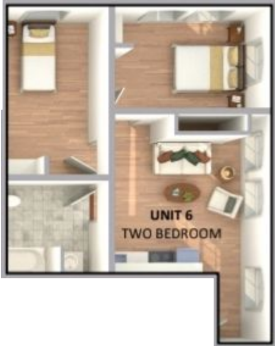
Two bedroom layout = full bath, kitchenette, living room, and two bedrooms